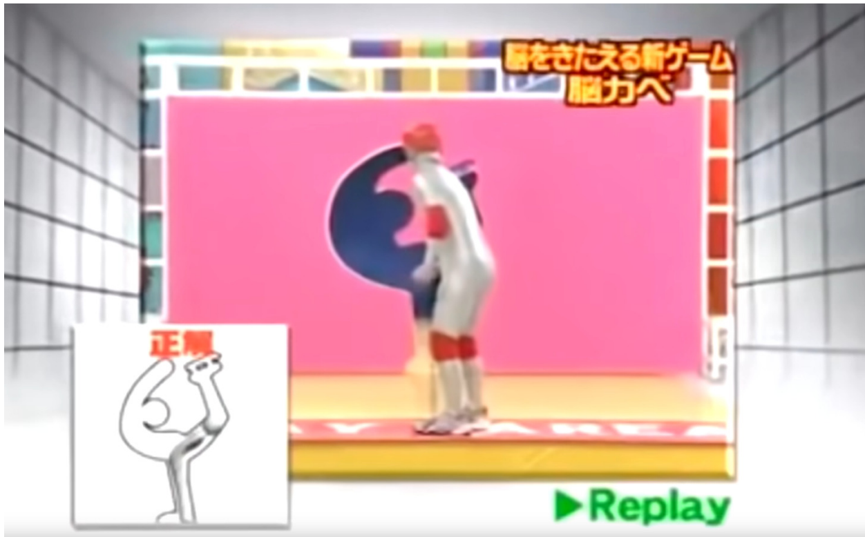
Figure 1: Screen capture of the TV Show

After cleaning up bit rot in underground mines and communicating with aliens, an era of peace and leisure has arrived in Lambda land. This has led to a number of TV game shows really taking off. One of these is Brain Wall , a contest originating in Japan. Many local versions of this have aired across the globe and it is sometimes better known as Human Tetris or Hole in the Wall .